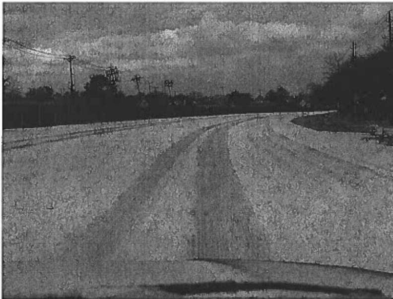
On Feb. 15, Parkwood Avenue in Friendswood saw a thin blanket of snow.